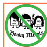
Free of Heavy Metals